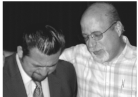
pastors praying for each other

before). This time the Lord woke me in the middle of the night to call the pastors that I know in the city and invite them to pray. He said "tell them that you will do only prayer." I followed the call and we have been meeting for prayer for over eight months now. From this prayer time I found out one day that one of the pastors had a car accident in which he lost his van with a customized wheelchair ramp and lift installed in it. He shared with me his struggle with the insurance company to pay for a replacement. I told the other pastors about it and one of them suggested we pray for him and take him an offering. After that another pastor told us of his problem with serious leaking problems he was having with